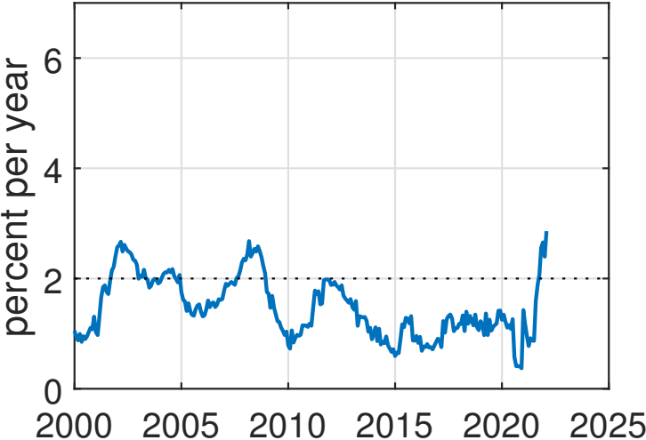
HICP ex energy and unp. food yoy, 2000:1-2022:2